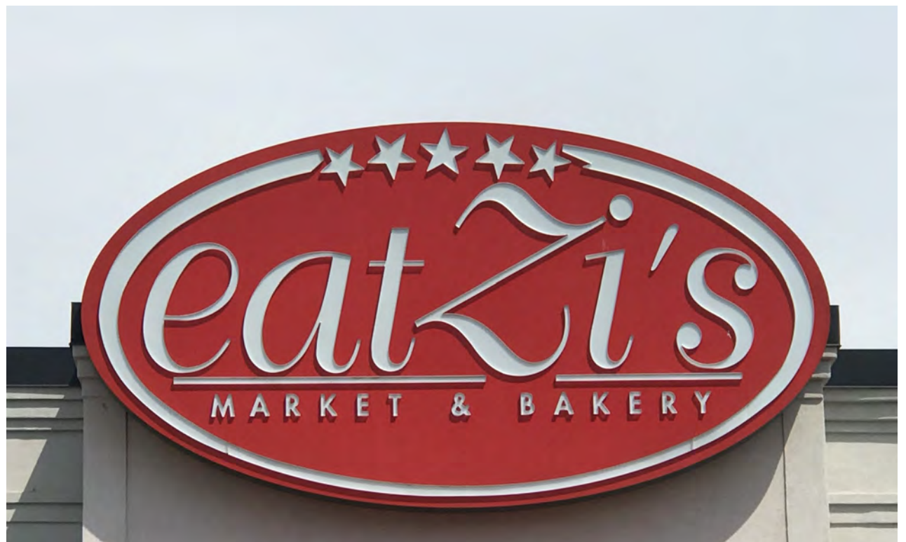
Eatzi's famous logo store front sign.