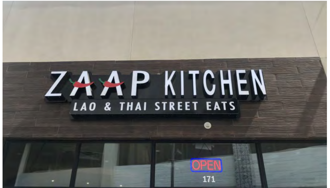
ZAAP Kitchen store front Fort Worth location.

Angelo's BBQ is located at the end of White Settlement Road near the Fort Worth Stockyards. Angelo's offers a change in scenery for a log cabin, local treat feel. For over 60 years it has been serving the people of Fort Worth and