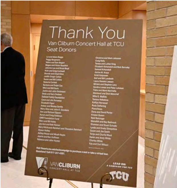
The list of Seat Campaign donors.