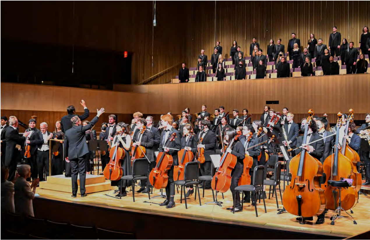
The choir performing along with the orchestra on opening night.