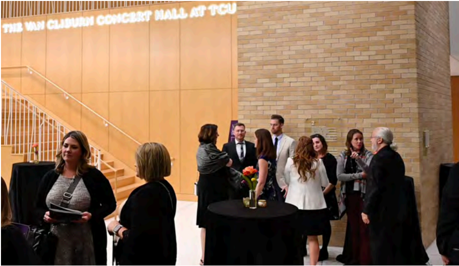
Outside of the Van Cliburn Concert Hall at TCU after the show April 8, 2022.