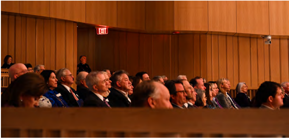
The audience inside the van Cliburn Concert Hall at opening night.