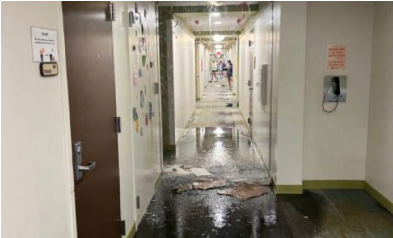
Colby Hall flooding on Monday, Oct. 21 2024.

$14.70 monthly for on-campus living. The price varies for students off campus.